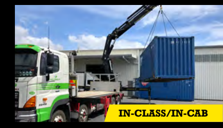
Heavy Vehicle Load Security