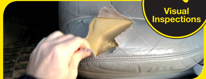
→ Worn/Ripped Seat