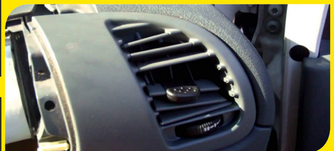
→ Broken Vent Outlet