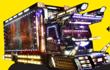
← Check all lights and lenses.

These inspections could alleviate potential downtime, missed on-charges, accidents/incidents, truck/trailer abuse and also ensure vehicle safety before going out on the road.