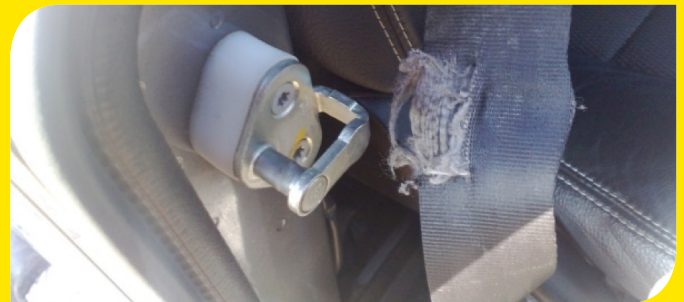
→ Damaged/Frayed Seat Belt that is no longer compliant and needs to be replaced. In this case, it seems the seat belt has got stuck/jammed in the door lock and frayed.